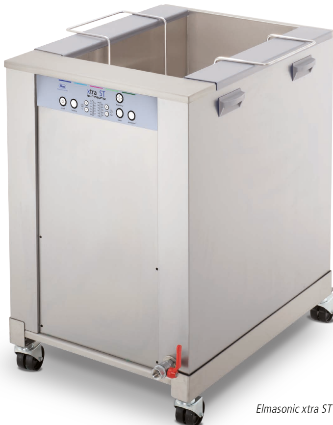
Elmasonic xtra ST 1900S