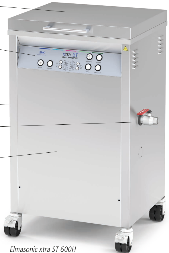
Elmasonic xtra ST 600H

High mobility , since devices are on industrial rollers