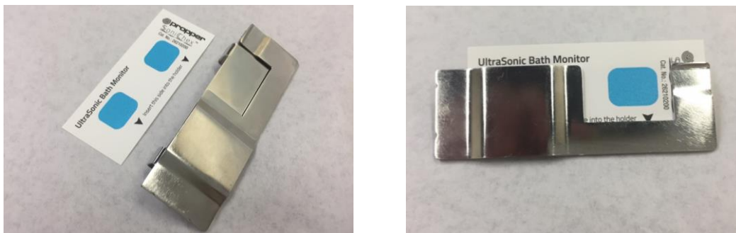
FIGURE 1. OK-SONIC MONITOR AND THE HOLDER

When placed in an ultrasonic cleaner, the blue soil is slowly removed by cavitation in the cleaning bath. Presence of detergent and pre-soaking phase expedite this process. The soil spots wash off completely from the substrate when exposed to sufficient cleaning cycle parameters. The purpose of the two indicator spots is to represent open surfaces and difficult-to-clean parts of instruments. Both indicators soil spots have identical composition, and are designed to be used with the monitor holder, which has one open and one covered side. The holder acts as a process challenge device, which covers indicator stain on one side of monitor strip while leaving the other stain spot fully exposed. The covered stain simulates conditions that are challenging for cleaning. The open stain area simulates full exposure to cleaning cycle parameters inside ultrasonic cleaner basket where the OK-Sonic monitor is placed.