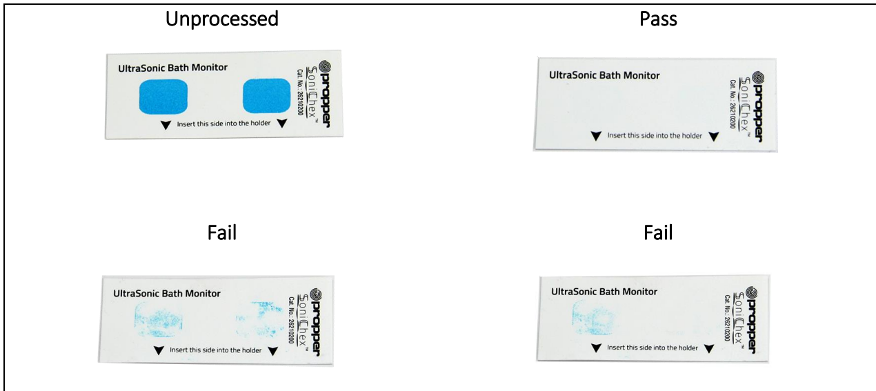
FIGURE 3. UNPROCESSED, FAIL, AND PASS RESULTS OF OK-SONIC.

OK-Sonic monitors are printed with two blue reactive soil spots. When the indicators are exposed to an ultrasonic cleaning cycle the blue ink is slowly removed by energy of cavitation and action of detergent. If, at the end of the cycle, there is any remaining blue ink, the result is a fail (Fig.3).